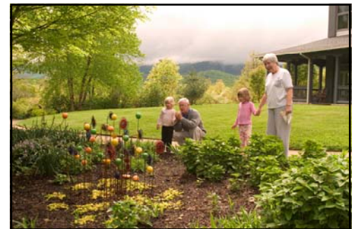
North Carolina Arboretum