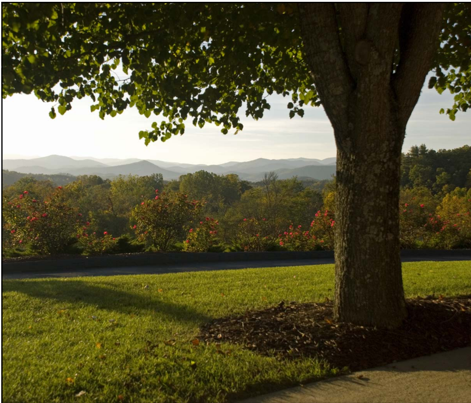
View of the Blue Ridge Mountains from the clubhouse.

Restaurant Highlights Membership Sports Complex Around the Cove